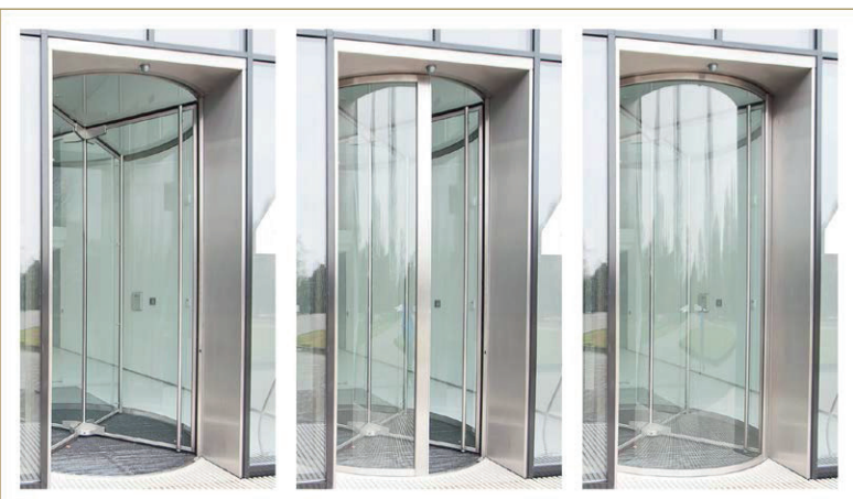
Opened night door